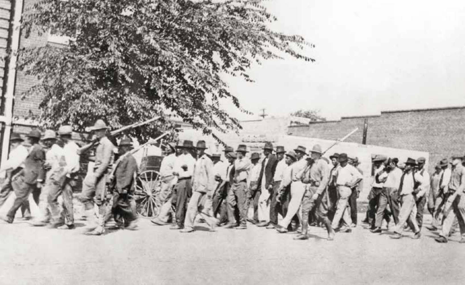
National Guard Troops escort unarmed African American men after the Tulsa Race Massacre.

spirit. The discovery of the massive Glenn Pool oil reservoir led to a boom that transformed Tulsa practically overnight. Tulsa's white population quadrupled to more than 72,000 between 1910 and 1920, while the Black population swelled from 2,000 to 9,000. And while the oil industry work itself largely excluded African Americans, the wealth changing Tulsa into "The Magic City" spawned economic opportunities for the city's rapidly growing African American population as well.