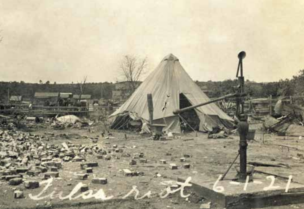
Many Black Tulsa lawyers practice out of tents after their offices were destroyed during the riot.

Oklahoma Supreme Court case arising out of an insurance coverage dispute. 17 William Redfearn was a white man who owned two buildings in Greenwood, the Dixie Theatre and the Red Wing Hotel, both of which were destroyed in the massacre. They were insured for a total of $19,000, but American Central Insurance Co. refused to pay based on a riot exclusion clause in the policies. Redfearn sued, lost at trial and appealed all the way to the Oklahoma Supreme Court. Although Redfearn lost, the briefing and record of the case – which includes hundreds of pages of eyewitness testimony and other documentation – provides valuable insight into the massacre, especially the culpability of the Tulsa police department and their “special deputies” who joined in the destruction and violence. 18