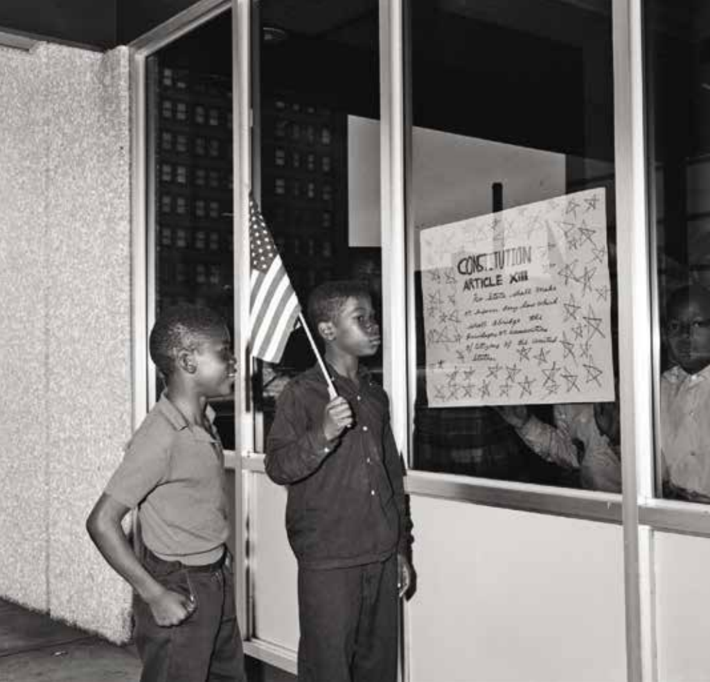
Two Black children observe a civil rights protest at Bishop's Restaurant in Oklahoma City on May 31, 1963.

The first lynching of a man of African descent happened on December 27, 1907, in Henryetta. Gordon, a man of African descent, was arrested for shooting Bates, a white man, during an argument. When news of the murder made its way to whites, hundreds stormed the jail, took Gordon, lynched him from a telephone pole, and used his body as target practice. Within two days, the whites burned the residential district where the people of African descent resided and established a “sundowner” law. 12