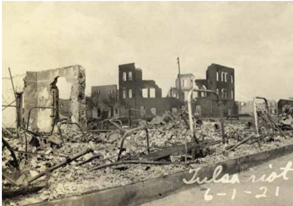
Iron bed frames lay in the rubble of burned buildings after the riot on June 1, 1921.

Ironically, some of the most complete documentation of the Tulsa Race Massacre is available thanks to an otherwise obscure