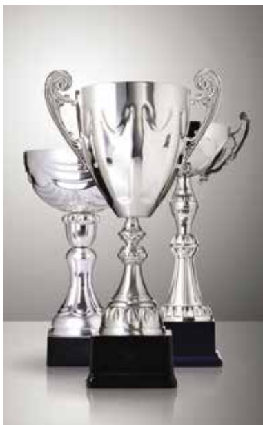
PAGES 36 and 40 – OBA & Diversity Awards