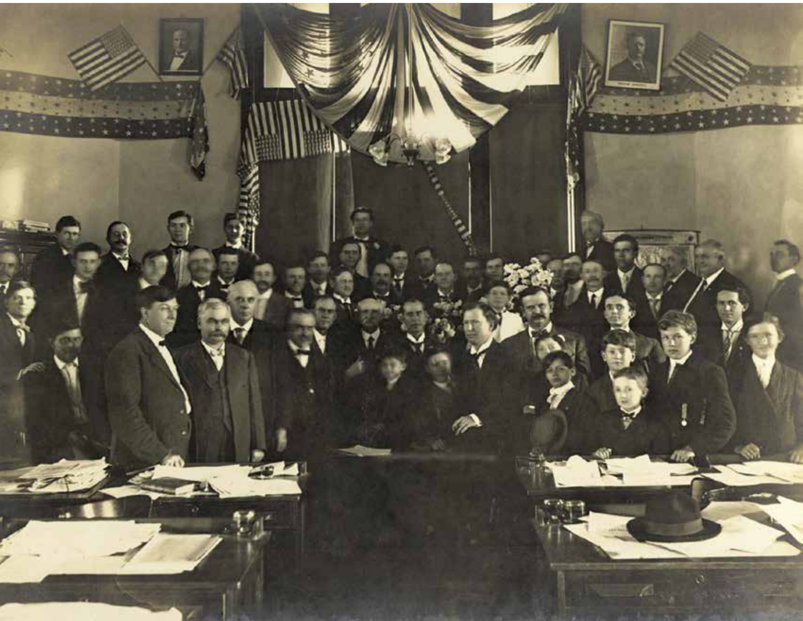
The first Oklahoma Legislature signs the first Jim Crow law on Dec. 18, 1907.