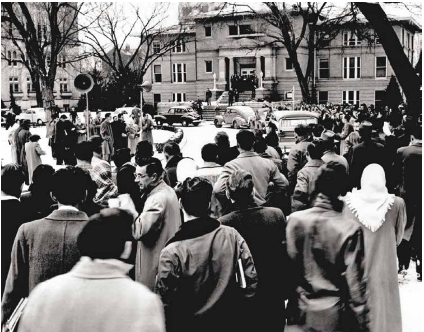
Over 1,000 students gather at the University of Oklahoma North Oval on Jan. 29, 1946, to support Sipuel. At the rally, they burned a copy of the 14th Amendment and mailed the ashes to President Truman.

she applied again to the OU law school and continued her legal battle with the state. A trial was held in May 1948 to determine whether the newly established Langston School of Law with its part-time faculty, rented rooms in the Oklahoma Capitol and no students was substantially equal to OU law school with its highly respected, full-time faculty, established physical facility and robust student body and alumni base. The NAACP called expert witnesses from across the nation, including the deans of Harvard Law School, University of Pennsylvania Law School, Boalt