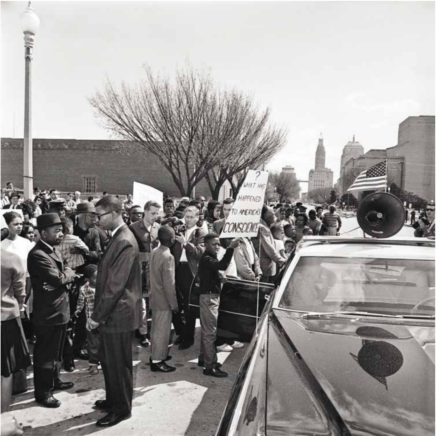
The NAACP civil rights march on North Shartel Avenue in Oklahoma City on April 3, 1965.

administration of the laws. We can no longer afford to make excuses about our inability to achieve diversity in the office, on the bench and at the podium. If we are making efforts, individually and collectively, and those efforts are not working, we must return to the drawing board. Members