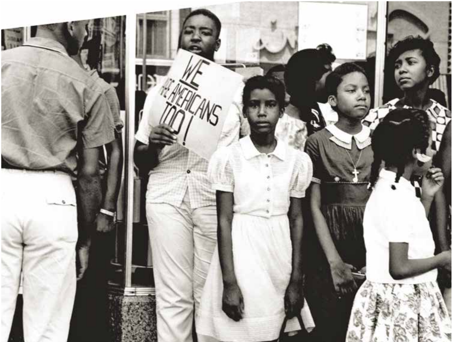
A Black man holds up a sign in Oklahoma City on Aug. 17, 1960.

After statehood, in addition to laws enforcing racial segregation, violence took on a more prominent role. Lynching had taken place in Oklahoma from 1893–1895, with cattle or horse theft and robbery noted as the main offenses. 10 After statehood, lynching was reserved primarily for Africans and African descendants. 11