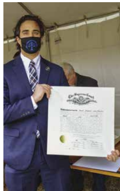
PAGE 42 – New Lawyers Take Oath