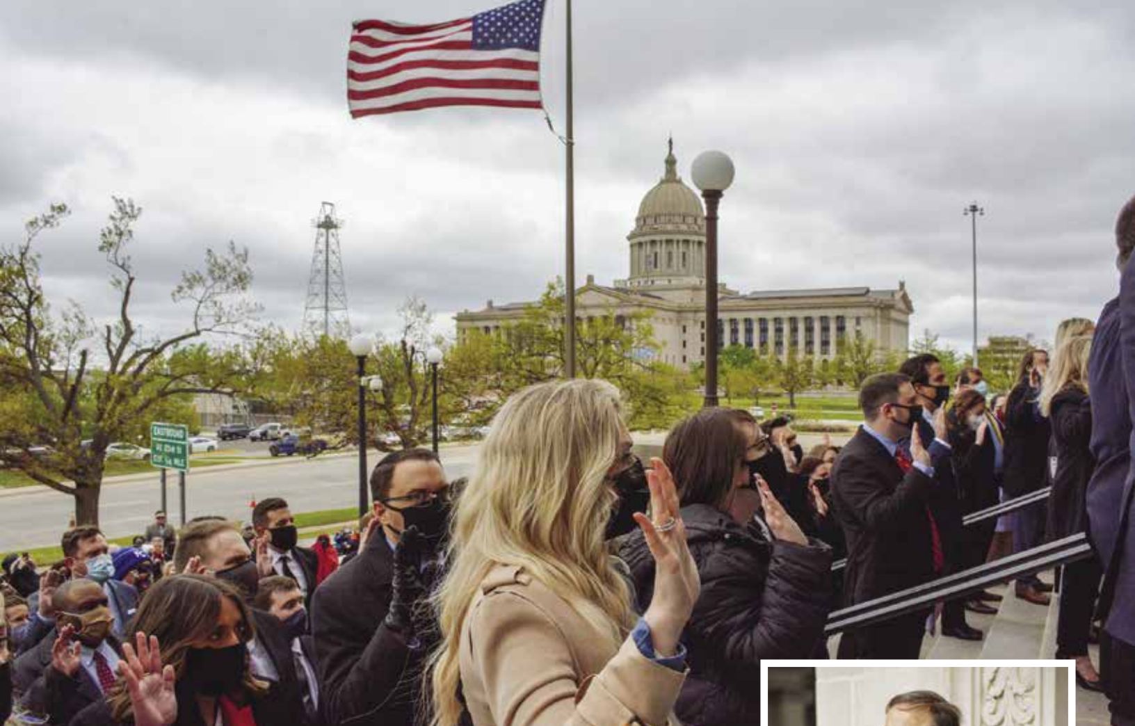
Candidates raise their right hands as they take the Oath of Attorney on the steps of the Oklahoma Judicial Center.