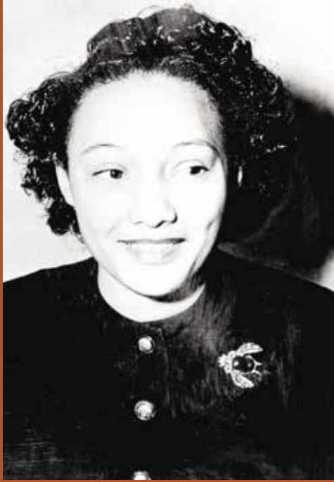
Ada Lois Sipuel Fisher

ADA LOIS SPUDEL FISHER leaves a legacy that impacted the legal profession and the Civil Rights Movement. Born in Chickasha, she graduated in 1945 with honors from Langston University, which did not have a law school. Segregation existed and Black people were prohibited from attending white state universities. Fisher decided to apply for admission to the OU College of Law to challenge the state's segregation laws and to accomplish her life-long goal of becoming a lawyer. State statutes prohibited the college from accepting her. A lawsuit was filed that resulted in a three-year legal battle. After an unfavorable ruling by the Oklahoma Supreme Court, an appeal was filed with the U.S. Supreme Court. Another barrier was erected with the creation of a separate law school thrown together in five days exclusively for her to attend. She refused to attend on the grounds the new school could not provide a legal education equal to OU's law school. A state court ruled against her, and the state Supreme Court upheld the decision. Ms. Fisher's lawyers planned to again appeal to the U.S. Supreme Court, but Oklahoma's attorney general declined to return to Washington, D.C., to argue the case. She was admitted to the OU College of Law on June 18, 1949, and graduated in August 1951.