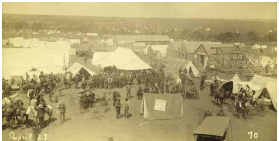
Following the Land Run, people set up tents along a dirt street on April 27, 1889.

In 1889, the Indian Territory was opened by the U.S. government to settlement. People from all over the U.S. and beyond came to settle in Indian Territory. The process further marginalized